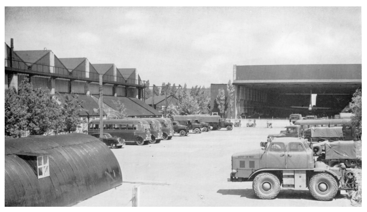
3910 Motor Vehicle Squadron motor pool