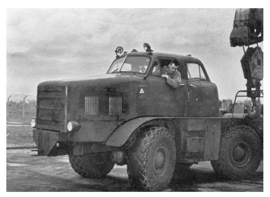
3910 Motor Vehicle Squadron airman parking a Coleman