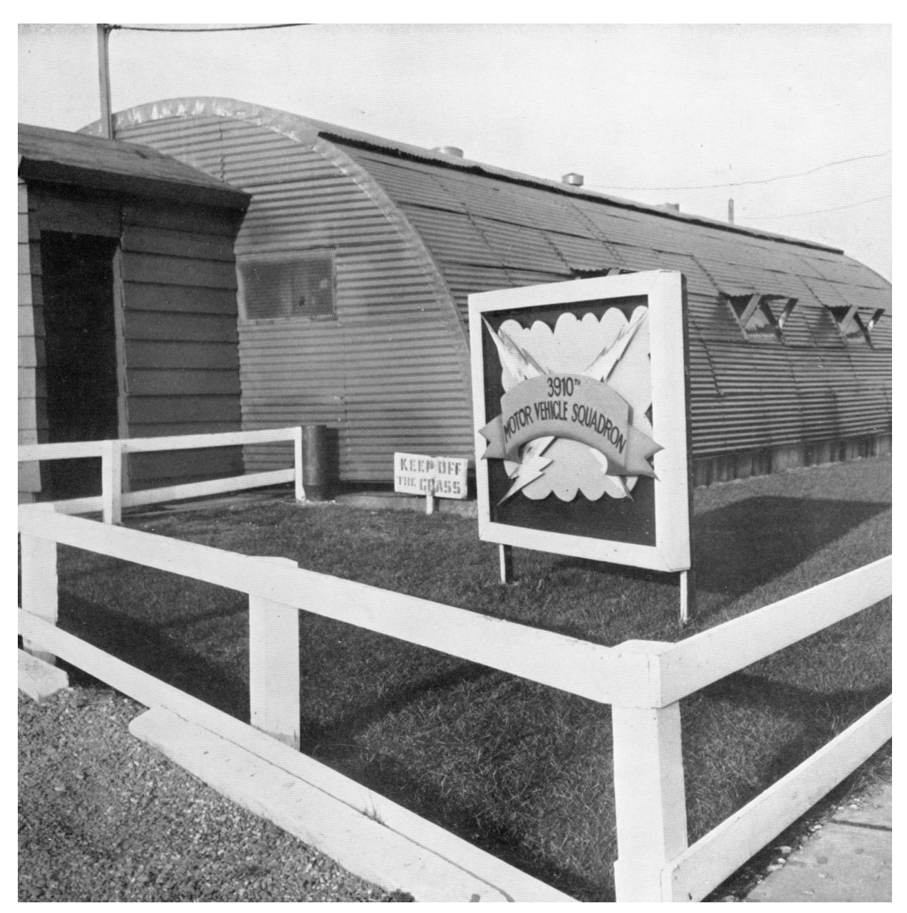
3910 Motor Vehicle Squadron headquarters, Mildenhall, England